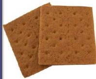
2 graham crackers